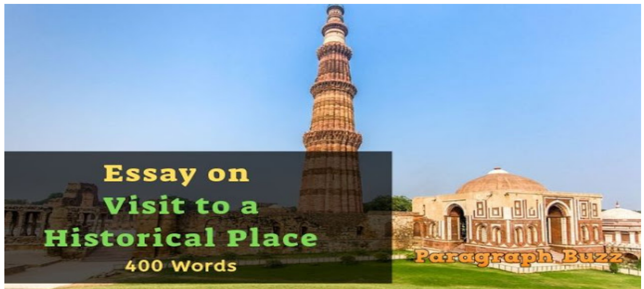
Essay on Visit to a Historical Place

Introduction: Traveling is always fun and if it's with your family then it's really so much fun. I have got that fun experience a few weeks earlier. I always appreciate my family as the best family and they are really supportive with me. I was asking my father for a tour after the summer vacation . He was