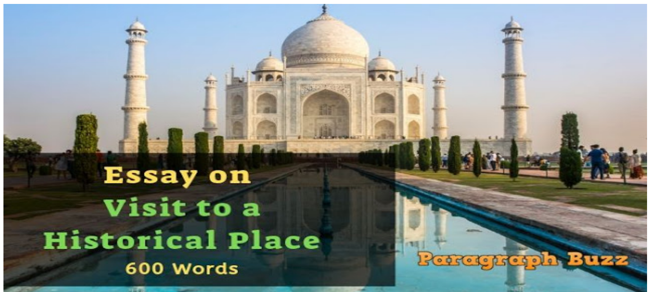
Essay on Visit to a Historical Place