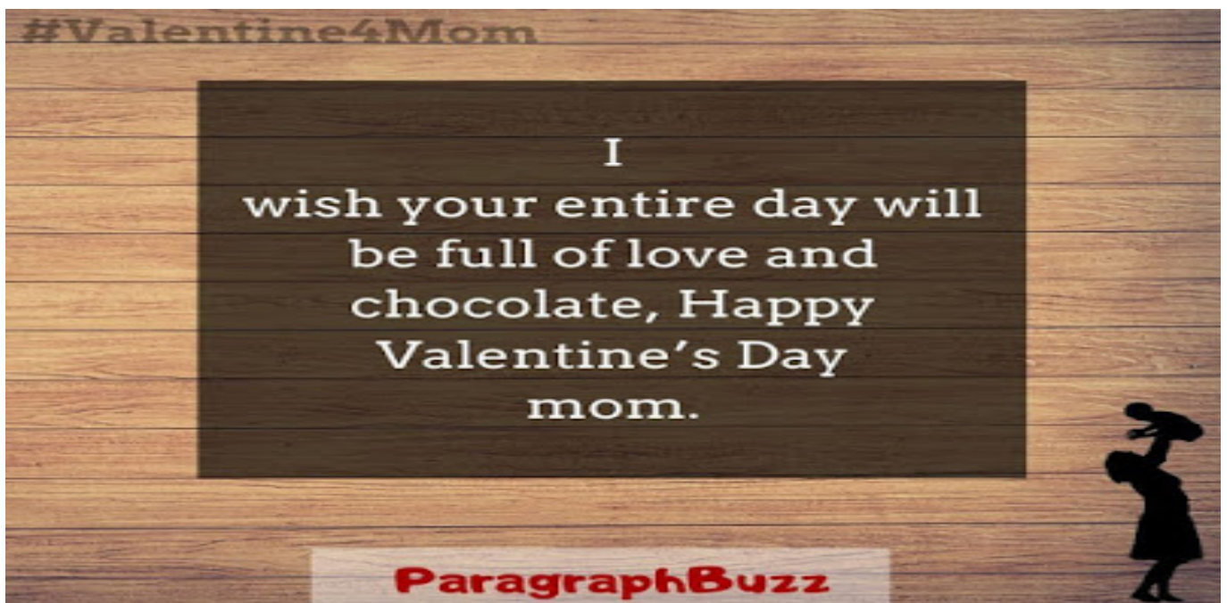
Loving Messages for Mom in Valentine's Day