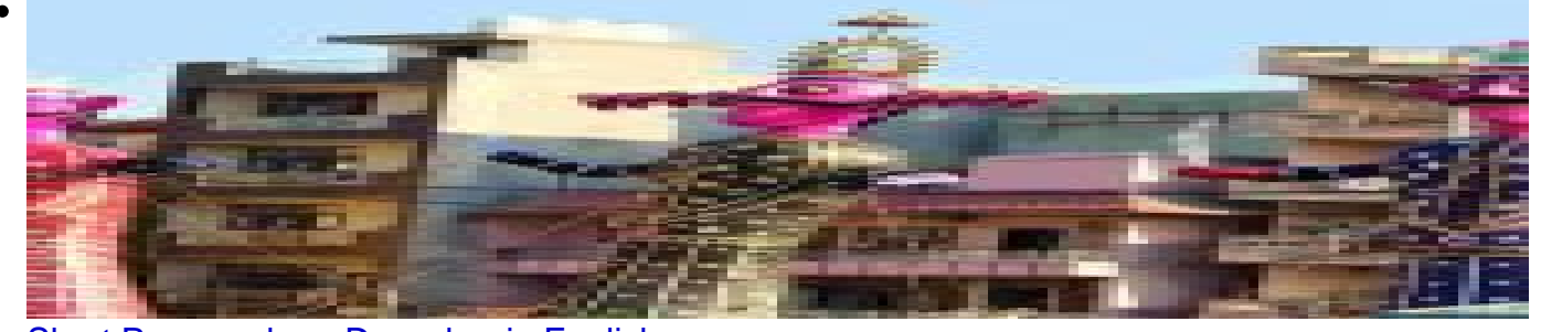
Short Paragraph on Dussehra in English Short Paragraph on Dussehra in 200 Words Dussehra is a Hindu festival celebrated all across