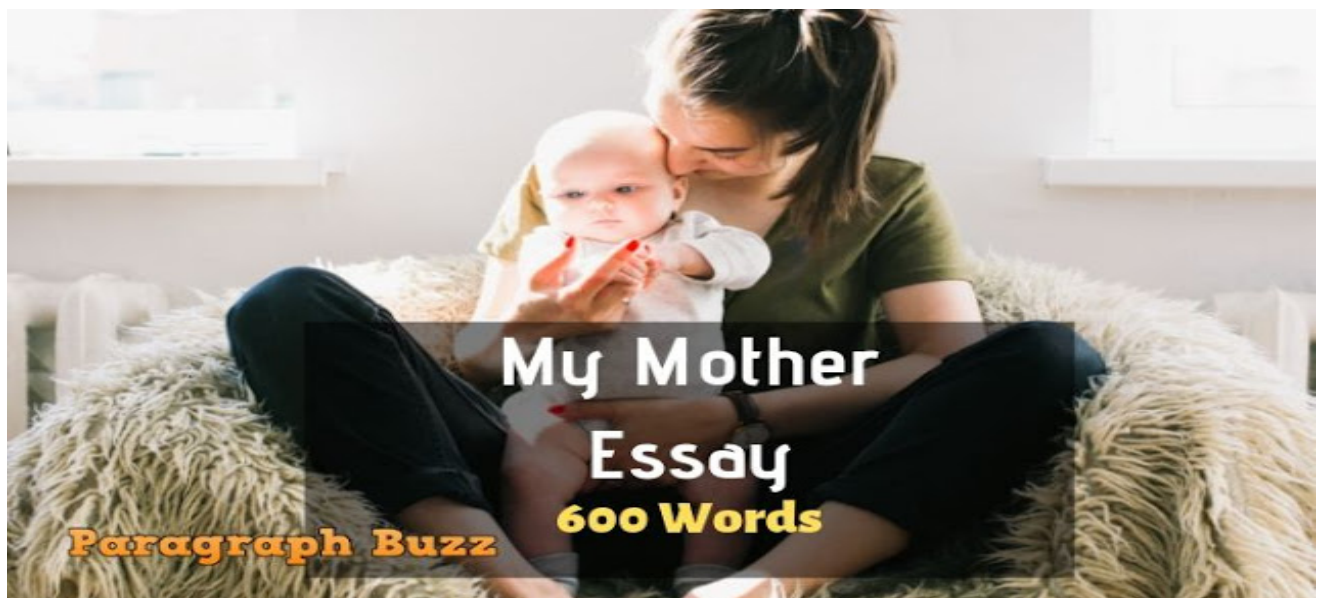
Essay on My Mother – 600 Words

Introduction: Every mother in this world is really amazing for their kids. Today I am going to share something about my own mother. I think everyone should love and respect their mother because she is the one who gave us birth and let us see this beautiful world. She has tolerated so many pain and problems because of raising us in a good way.