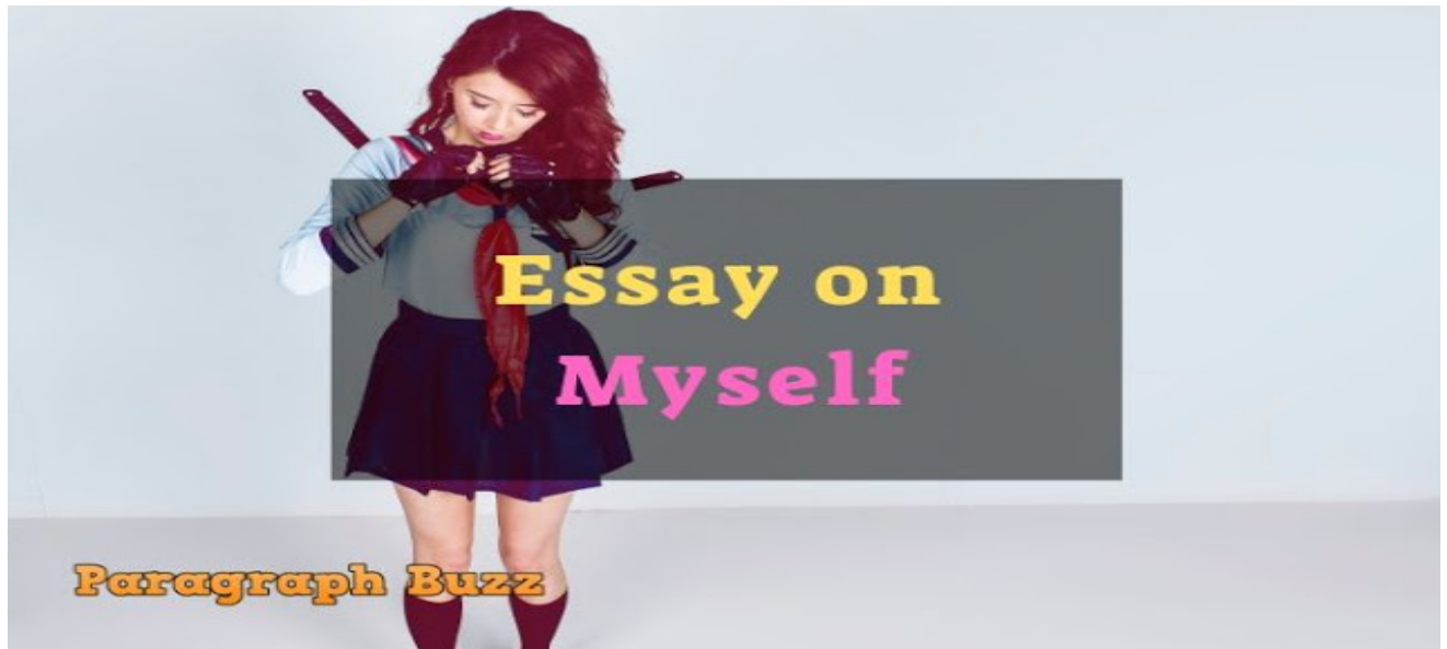
Essay on Myself in 600 Words