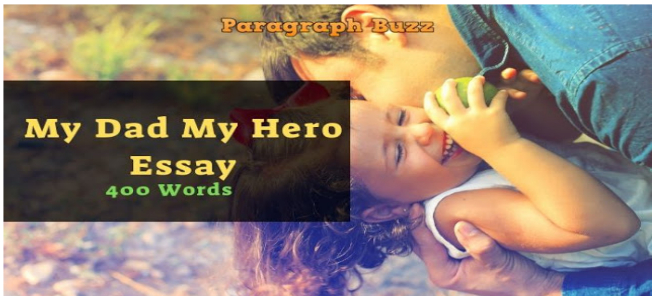
Essay on My Dad My Hero in 400 Words

Introduction: In our life, we consider some people as a hero. A father is the most common hero in our life. In my life, I used to consider Superman, Spiderman, X-man, etc as my superhero. But when I realized the contribution of my father in my life, I started thinking of him as my hero. Today I will share my feelings and thinking about this hero.