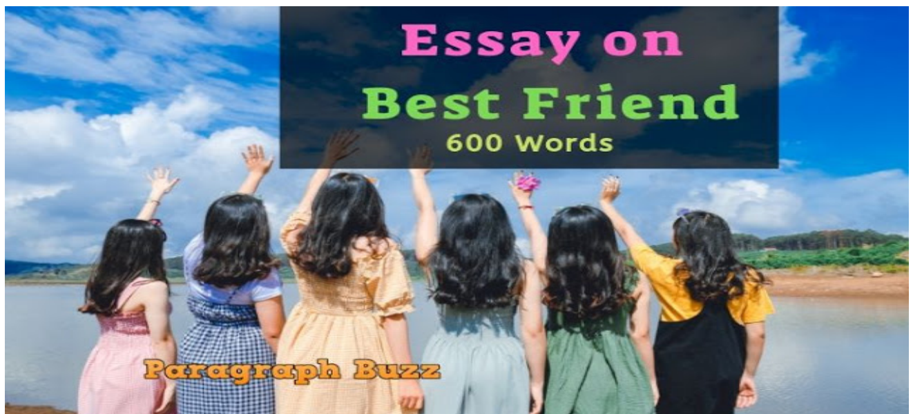
Essay on My Best Friend in 600 Words

Introduction: Friendship is a really good relationship between two humans. We all have friends and we understand the importance of friendship very well. We need to respect this relationship and need to work making our friendship better with our friends. But in most of the case, we have a special friend who is totally different from the others, who are so much similar to me and who understand me very well. Yes, we all have that friend. We call him 'best friend'. Today I will share lots of things about my best friend.