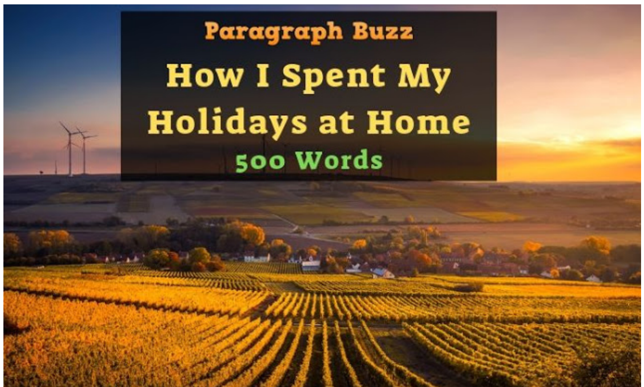
Essay on How I Spent My Holidays at Home

Introduction: Today I am going to share my experience on how I spent my holidays at home. That was an amazing experience. I went to our village. We actually go there after a couple of years. That's why I always become excited. There are lots of things to do and see. My father spent his whole life in that village. Spending holidays in the village is really fun for me.