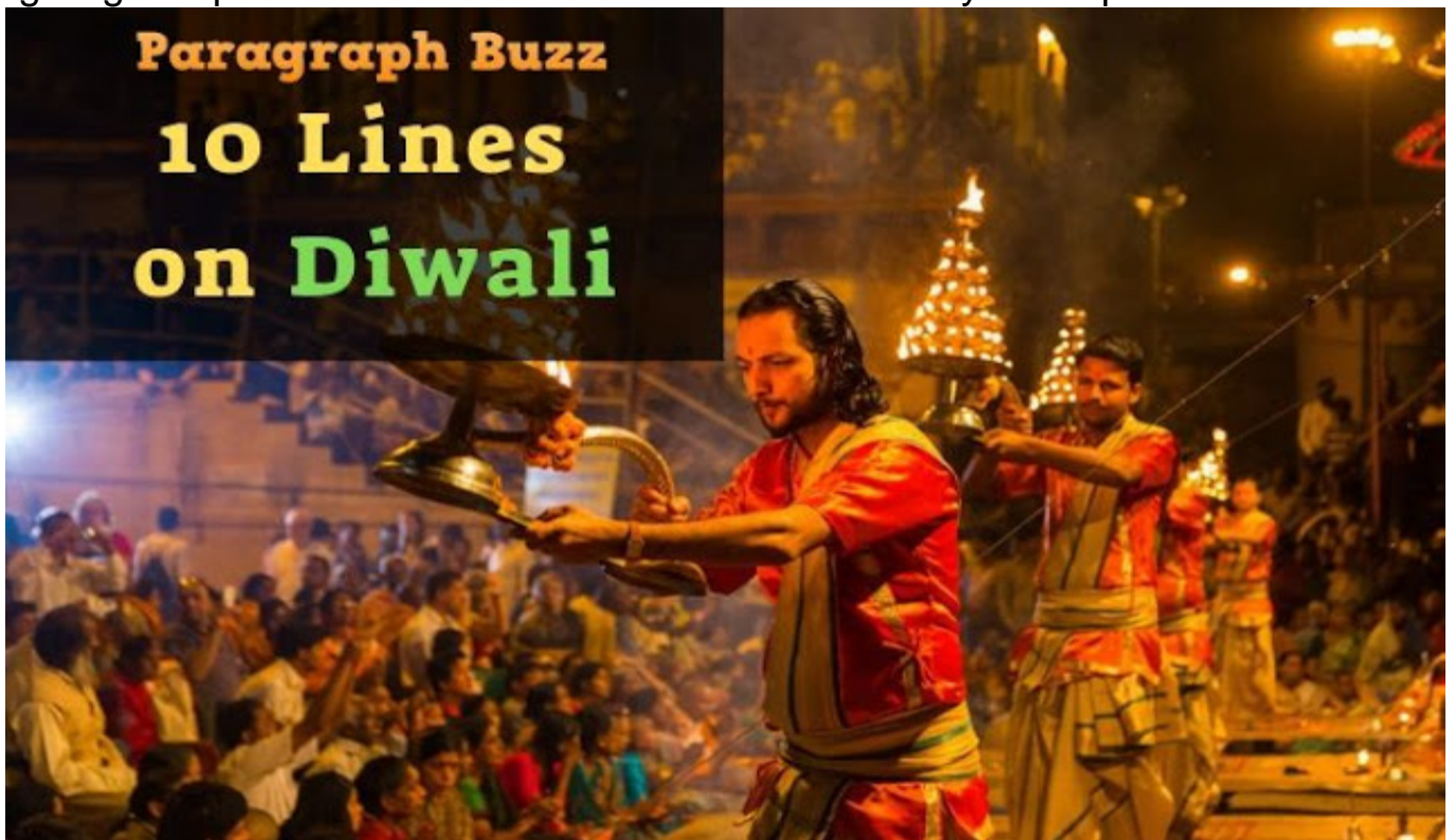
10 Lines on Diwali

Diwali is one of the biggest festivals among the Hindu people in India. Not only in India, other countries like Bangladesh, Nepal, and Hindu people from all across the world celebrate this day with huge fun. Today we are going to share a few lines on Diwali because it is one of the most important topics in the exam for all classes. We are giving samples of all classes. You must need to find your required one.